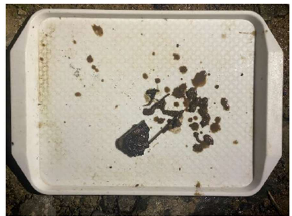
Hand Netting to search for S. zanklon