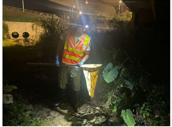
Kick-netting to search for S. zanklon