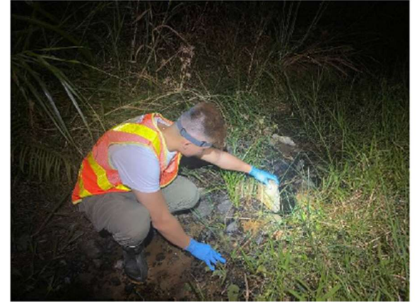
Direct Observation to search for S. zanklon