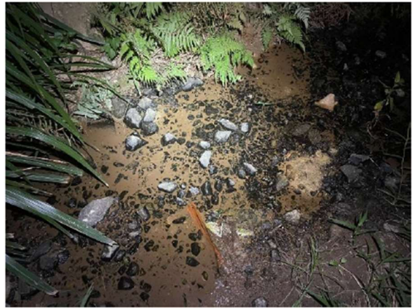
Site photos of the monitoring area