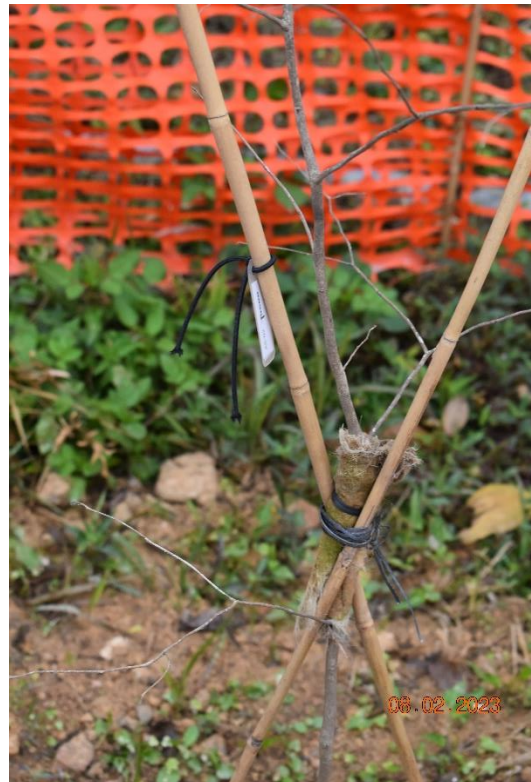
Photo B.1.4 : Branch condition of the transplanted individual AS-02.