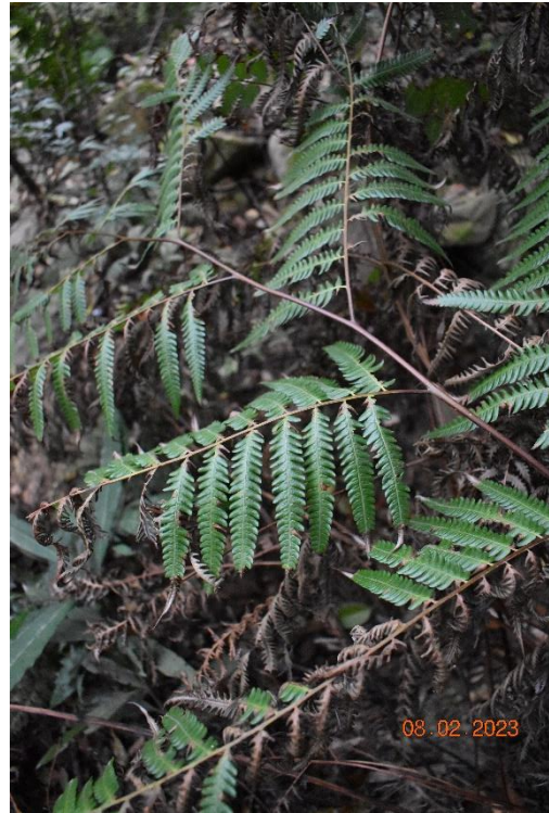
Photo B.2.2 : Leaf condition of the transplanted individual CB-01.