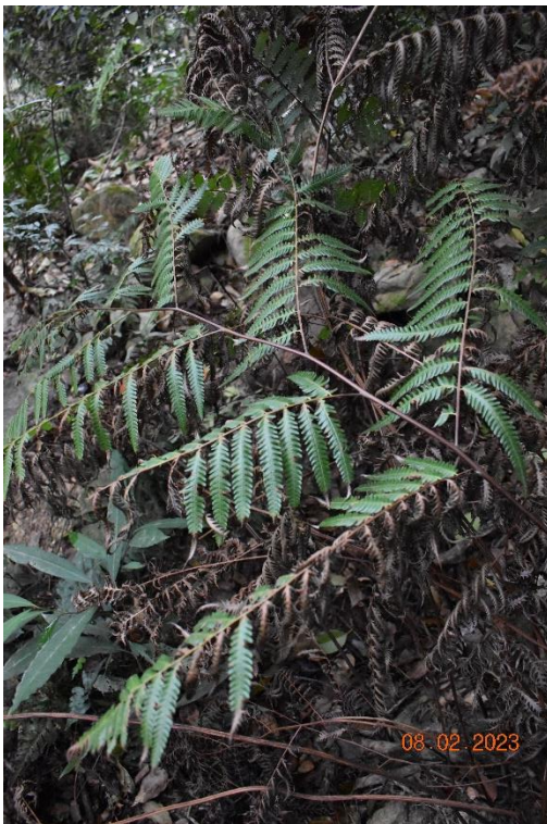
Photo B.2.3 : Leaf condition of the transplanted individual CB-01.