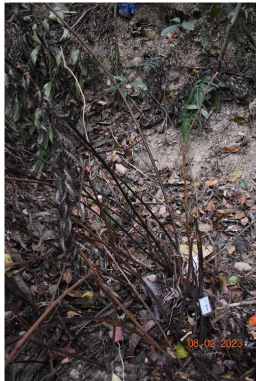
Photo B.2.4 : Stem condition of the transplanted individual CB-01.