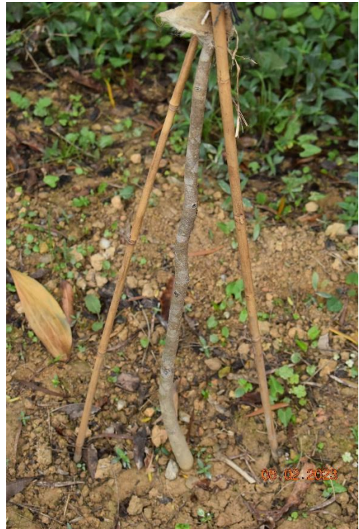
Photo B.1.2 : Stem condition of the transplanted individual AS-03.