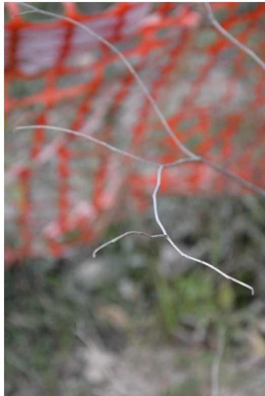
Photo B.1.4 : Branch condition of the transplanted individual AS-02.