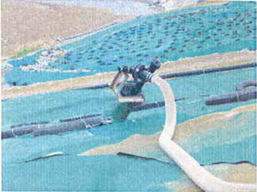
Well head & pipeline for extraction and conveyance of LFG