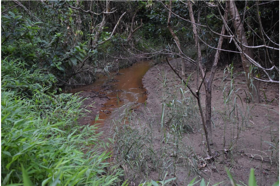
A.2.1: Watercourse Section adjacent to the truck water filling station within the Survey Area (NENTX)