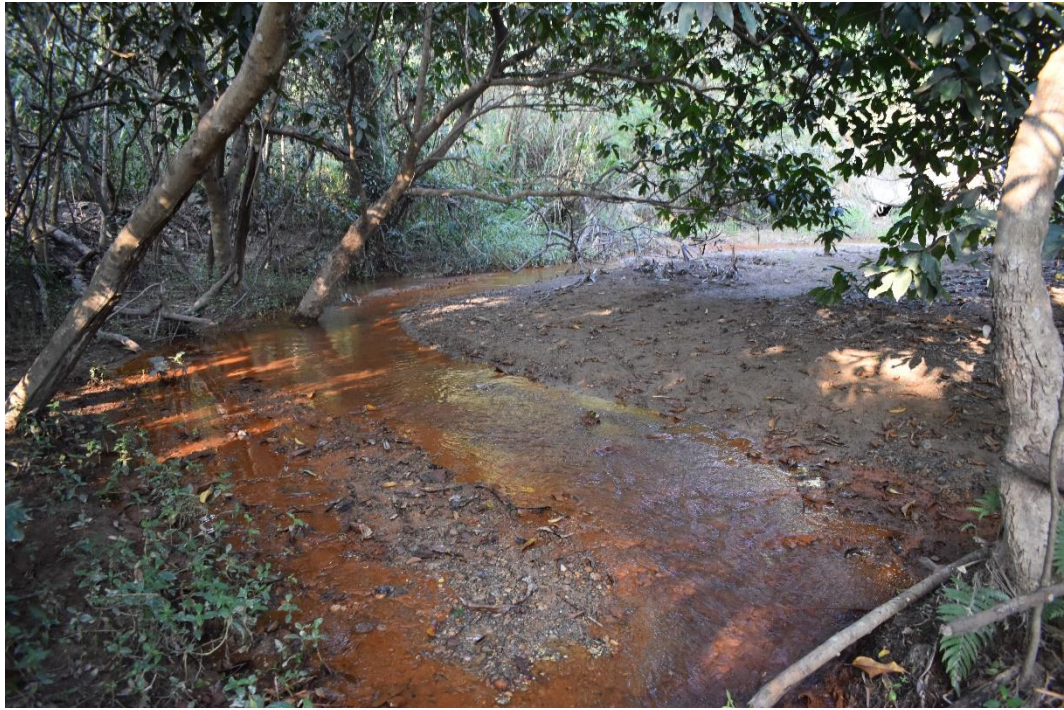
A.2.3: Watercourse Section along the Shek Shui Ancient Path, within the Survey Area (NENTX)