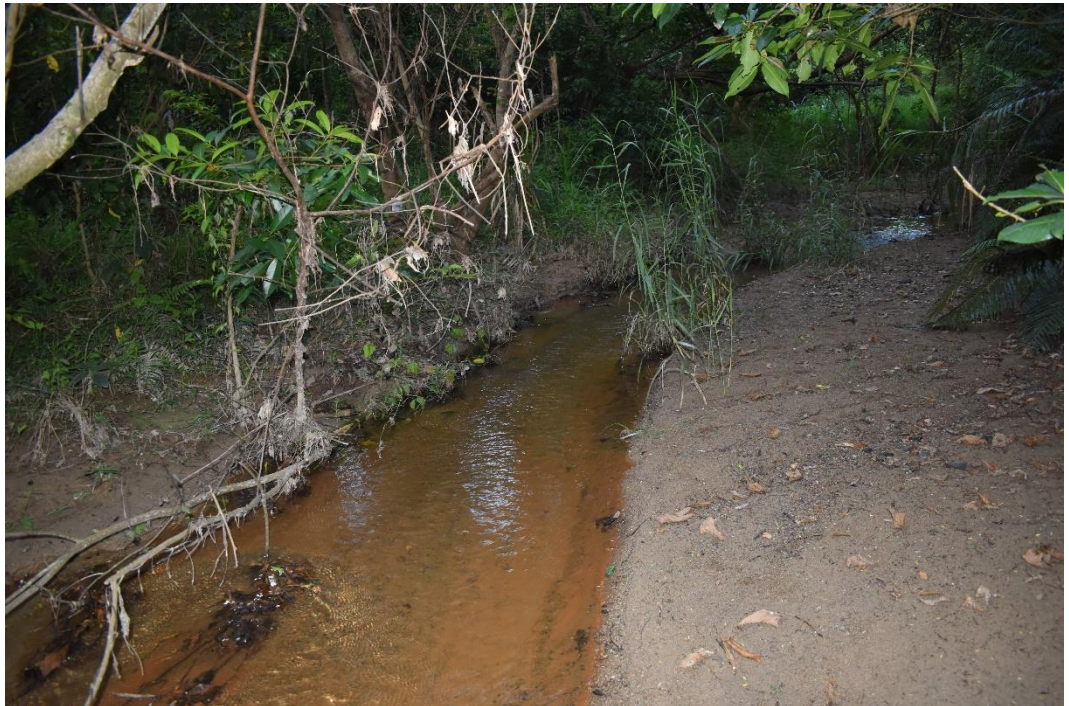
A.2.2: Watercourse Section adjacent to the truck water filling station within the Survey Area (NENTX)