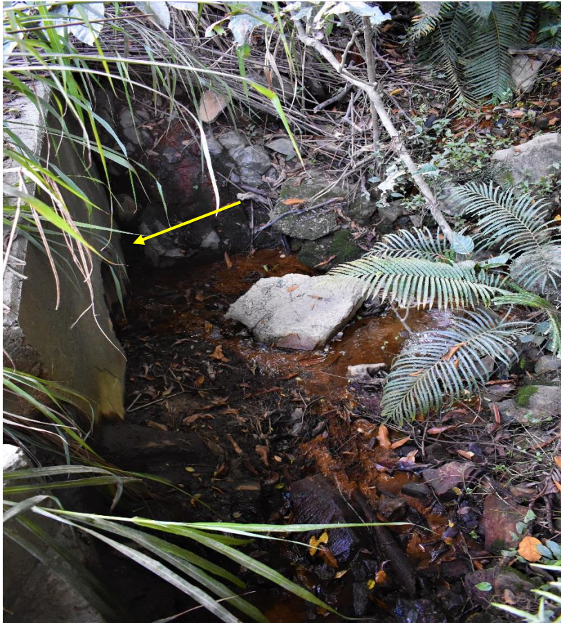
A.2.5: Ditch in the approved EIA study