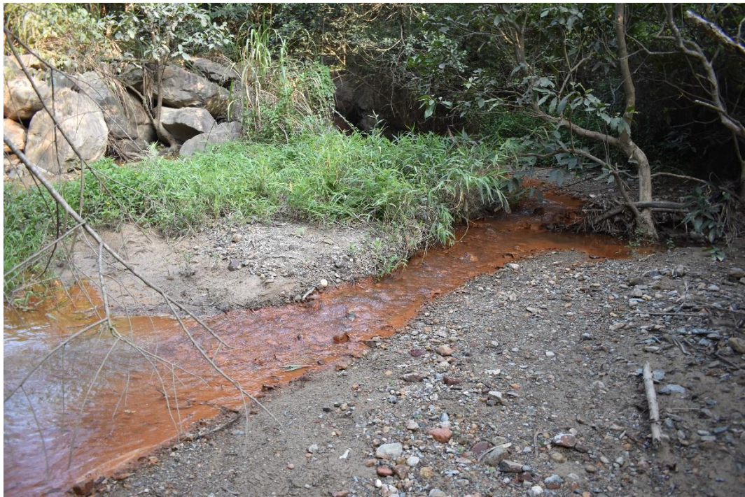
A.2.4: Watercourse Section along the Shek Shui Ancient Path, within the Survey Area (NENTX)