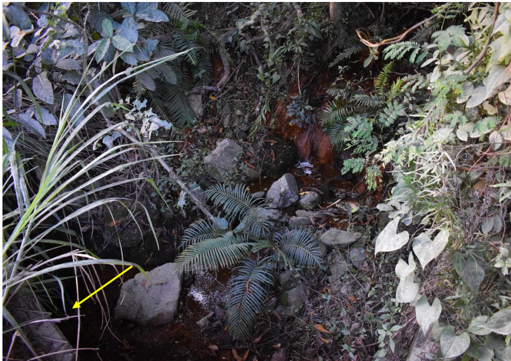
A.2.6: Ditch in the approved EIA study and its upstream section