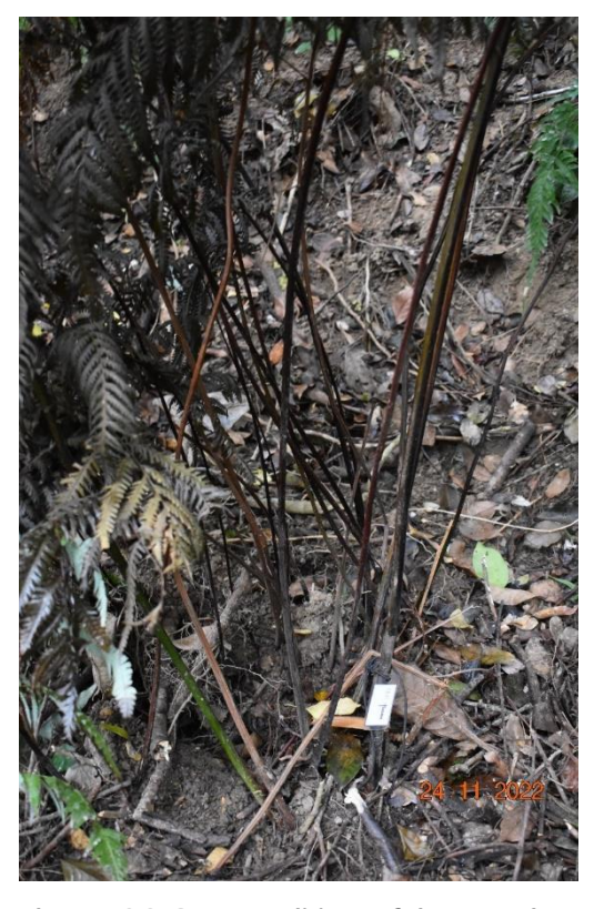
Photo B.2.3: Stem conditions of the transplanted individual CB-01.