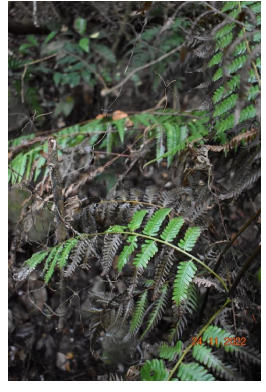
Photo B.2.2: Figure 2.2: Wilted leaves of the transplanted individual CB-01.