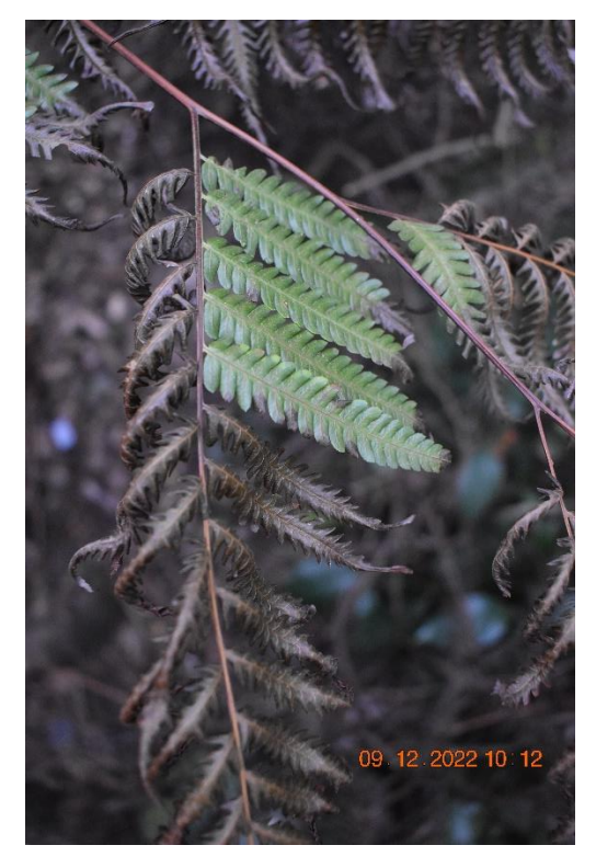
Photo B.2.2: Figure 2.2: Wilted leaves of the transplanted individual CB-01.