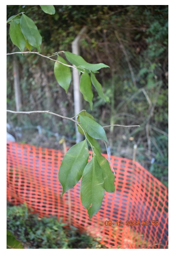
Photo B.1.2. : Leaf condition of the transplanted individual AS-03.