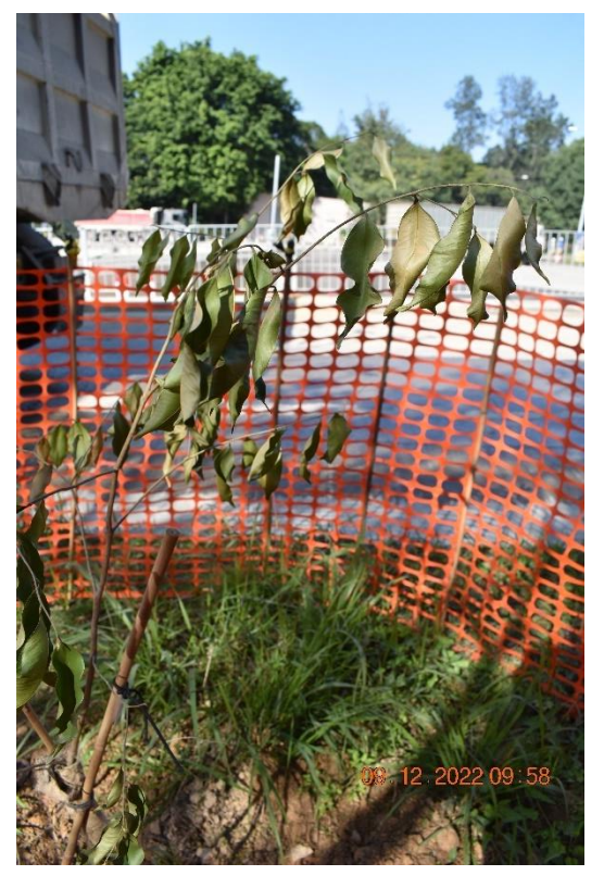
Photo B.1.4. : Leaf condition of the transplanted individual AS-02.