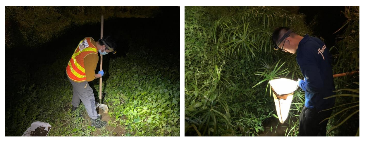
Photo 2.3: Surveyor kick-netting the substrate and checking the net's contents

2.4.3.1 Kick-netting (see Photo 2.3 ) was done along the watercourse by moving upstream with the net facing the water current. The surveyor disturbed the substrate by kicking the streambed substrate by kicking, such that the S. zanklon dislodged from the streambed would be trapped in the net. In order to maximise the survey effort within the stream, the surveyor moved up the stream in a zigzag direction to increase the kick sampling coverage. The net was checked after a maximum of one minute of kick sampling. Additionally, the net was checked more frequently if large amount of substrate was kicked into the net.