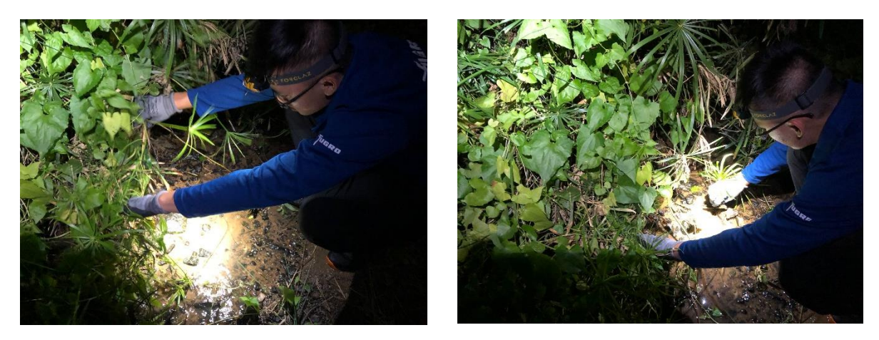
Photo 2.4: Surveyor searching for S. zanklon on potential hiding space (under vegetation) along the watercourse

Direct observation (see Photo 2.4 ) to search for S. zanklon in their potential hiding spaces was also conducted.