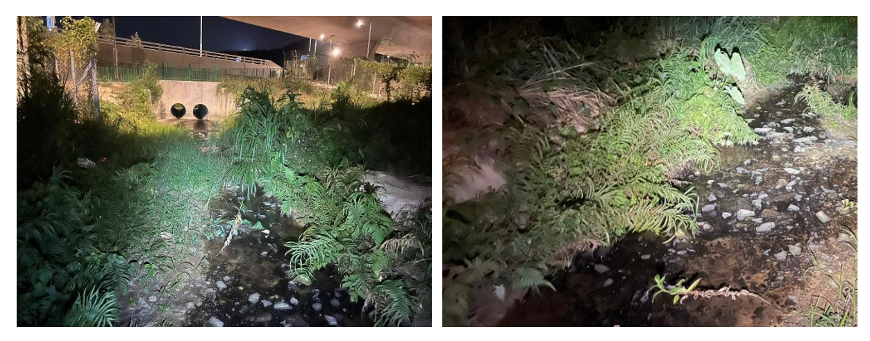
Photo 2.1: Section of the monitoring area with low gradient and low water flow