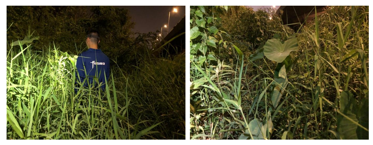
Photo 3.1: Dense growth of riparian vegetation in the monitoring area

3.1.1 There was no S. zanklon individual that was recaptured nor marked during the monitoring period ( Appendix C ). This could be attributed to the denser growth of the riparian vegetation in the monitoring area ( see Photo 3.1 ). The dense vegetation could have provided further refuge and protection for the crabs, making them more difficult to capture during the monitoring activity. Moreover, the individuals could have moved to a different area in search for food and habitats. For example, areas further downstream are also suitable habitats for S. zanklon .