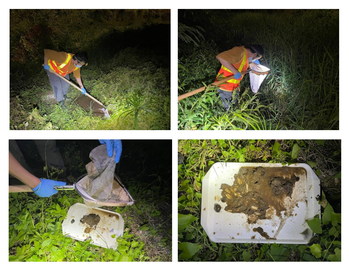
Photo 2.2: Hand netting at a potential habitat (vegetation) along the watercourse

2.4.2.1 Hand netting (see Photo 2.2 ) was used to search the potential habitats along the watercourse. The sweeping motion of the hand netting scraped the layer of the stream bottom substrate into the net, e.g., soil and leaf litter where possible, as S. zanklon is likely to be among these substrates. After taking the hand net out of the water, it was allowed to drain, and the net content was emptied on to a large sorting tray. All caught S. zanklon , if any, would be carefully moved to a plastic container for marking.