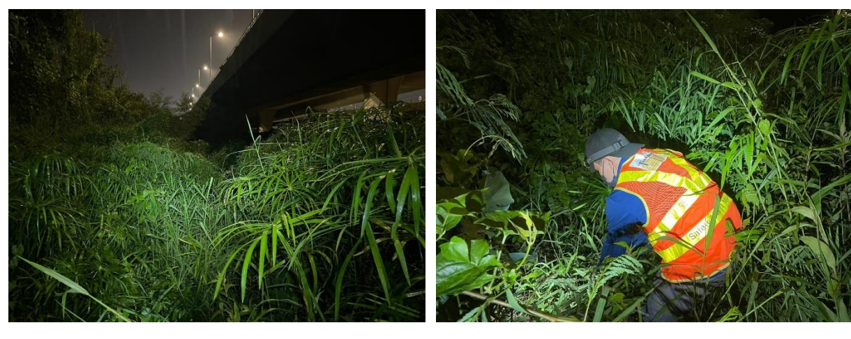
Photo 3.1: Dense growth of riparian vegetation in the monitoring area

3.1.1 There was no S. zanklon individual that was recaptured nor marked during the monitoring period ( Appendix C ). This could be attributed to the denser growth of the riparian vegetation in the monitoring area ( see Photo 3.1 ). The dense vegetation could have provided further refuge and protection for the crabs, making them more difficult to capture during the monitoring activity. Moreover, the individuals could have moved to a different area in search for food and habitats.