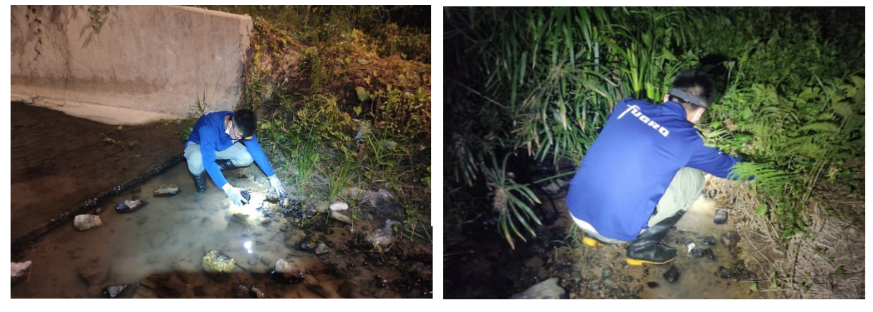
Photo 2.4: Surveyor searching for S. zanklon on potential hiding space (under vegetation and rocks) along the watercourse

Direct observation (see Photo 2.4 ) to search for S. zanklon in their potential hiding spaces was also conducted.