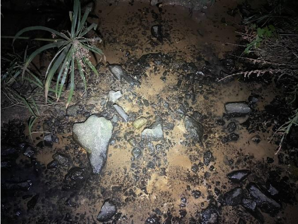
Photo 2.1: Section of the monitoring area with low gradient and low water flow