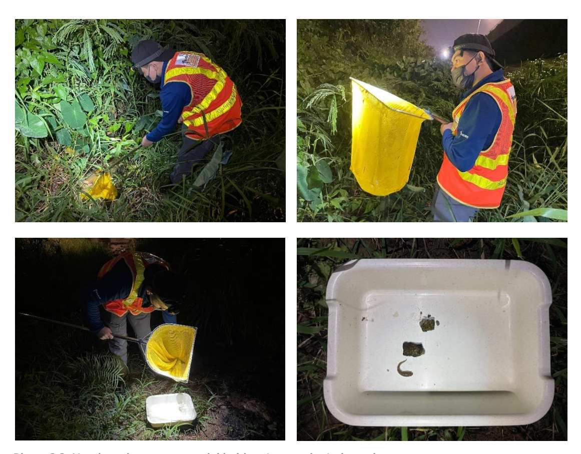
Photo 2.2: Hand netting at a potential habitat (vegetation) along the watercourse

2.4.2.1 Hand netting (see Photo 2.2 ) was used to search the potential habitats along the watercourse. The sweeping motion of the hand netting scraped the layer of the stream bottom substrate into the net, e.g., soil and leaf litter where possible, as S. zanklon is likely to be among these substrates. After taking the hand net out of the water, it was allowed to drain, and the net content was emptied on to a large sorting tray. All caught S. zanklon , if any, would be carefully moved to a plastic container for marking.