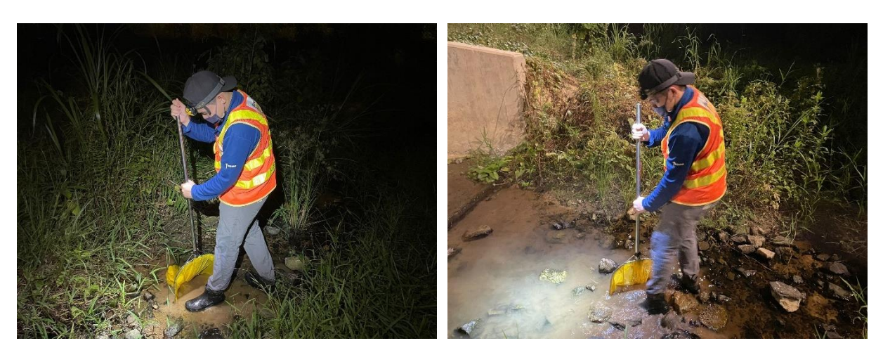
Photo 2.3: Surveyor kick-netting the substrate and checking the net's contents

2.4.3.1 Kick-netting (see Photo 2.3 ) was done along the watercourse by moving upstream with the net facing the water current. The surveyor disturbed the substrate by kicking the streambed substrate by kicking, such that the S. zanklon dislodged from the streambed would be trapped in the net. In order to maximise the survey effort within the stream, the surveyor moved up the stream in a zigzag direction to increase the kick sampling coverage. The net was checked after a maximum of one minute of kick sampling. Additionally, the net was checked more frequently if large amount of substrate was kicked into the net.