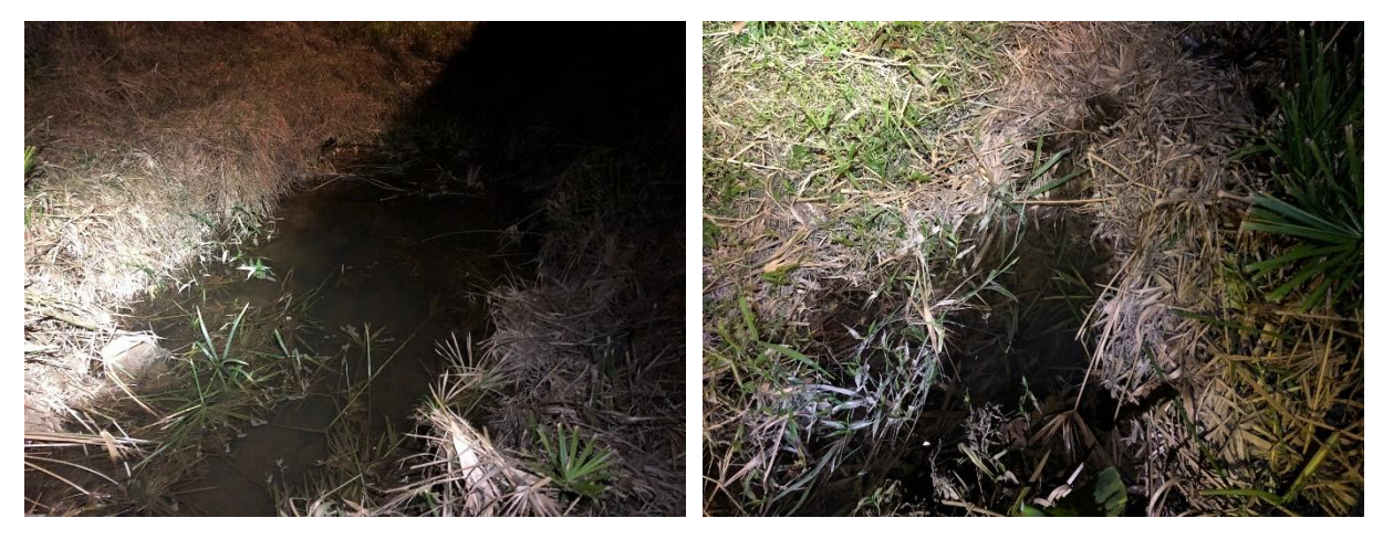
Photo 2.1: Section of the monitoring area with low gradient and low water flow