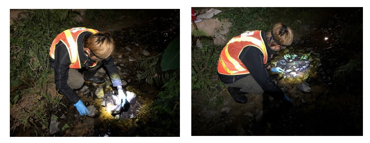
Photo 2.4: Surveyor searching for S. zanklon on potential hiding space (under vegetation and rocks) along the watercourse

Direct observation (see Photo 2.4 ) to search for S. zanklon in their potential hiding spaces was also conducted.