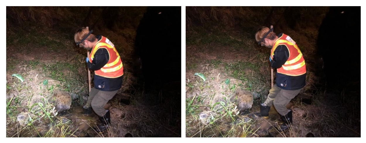
Photo 2.3: Surveyor kick-netting the substrate and checking the net's contents

2.4.3.1 Kick-netting (see Photo 2.3 ) was done along the watercourse by moving upstream with the net facing the water current. The surveyor disturbed the substrate by kicking the streambed substrate by kicking, such that the S. zanklon dislodged from the streambed would be trapped in the net. In order to maximise the survey effort within the stream, the surveyor moved up the stream in a zigzag direction to increase the kick sampling coverage. The net was checked after a maximum of one minute of kick sampling. Additionally, the net was checked more frequently if large amount of substrate was kicked into the net.