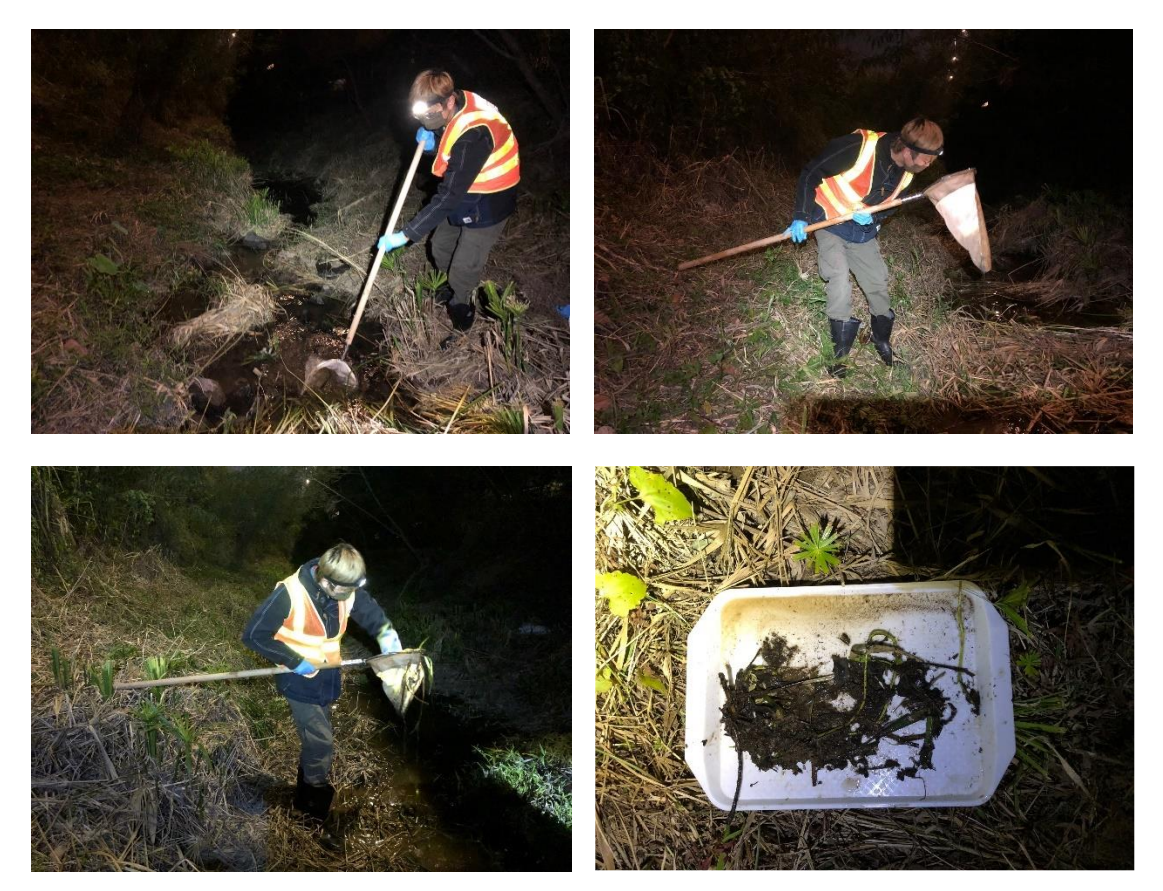
Photo 2.2: Hand netting at a potential habitat (vegetation) along the watercourse

2.4.2.1 Hand netting (see Photo 2.2 ) was used to search the potential habitats along the watercourse. The sweeping motion of the hand netting scraped the layer of the stream bottom substrate into the net, e.g., soil and leaf litter where possible, as S. zanklon is likely to be among these substrates. After taking the hand net out of the water, it was allowed to drain, and the net content was emptied on to a large sorting tray. All caught S. zanklon , if any, would be carefully moved to a plastic container for marking.