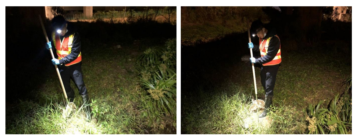
Photo 2.3: Surveyor kick-netting the substrate and checking the net's contents

2.4.3.1 Kick-netting (see Photo 2.3 ) was done along the watercourse by moving upstream with the net facing the water current. The surveyor disturbed the substrate by kicking the streambed substrate by kicking, such that the S. zanklon dislodged from the streambed would be trapped in the net. In order to maximise the survey effort within the stream, the surveyor moved up the stream in a zigzag direction to increase the kick sampling coverage. The net was checked after a maximum of one minute of kick sampling. Additionally, the net was checked more frequently if large amount of substrate was kicked into the net.