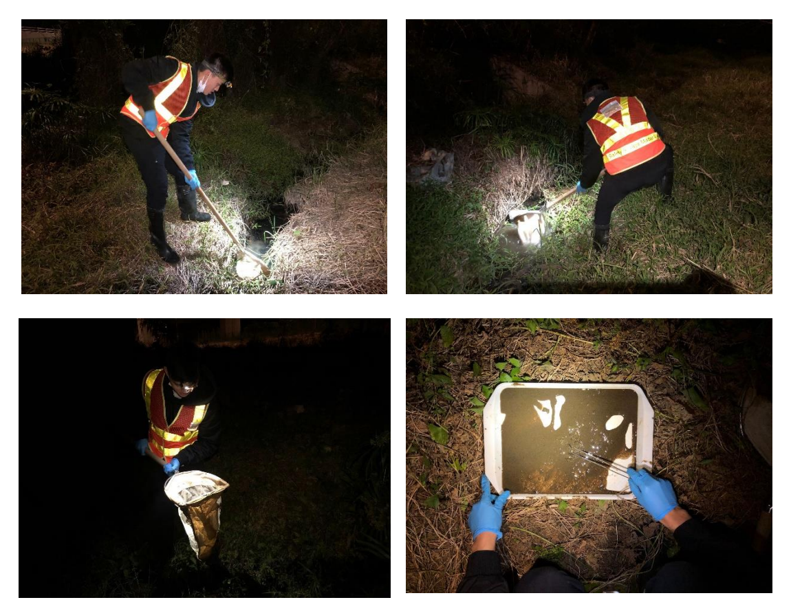
Photo 2.2: Hand netting at a potential habitat (vegetation) along the watercourse

2.4.2.1 Hand netting (see Photo 2.2 ) was used to search the potential habitats along the watercourse. The sweeping motion of the hand netting scraped the layer of the stream bottom substrate into the net, e.g., soil and leaf litter where possible, as S. zanklon is likely to be among these substrates. After taking the hand net out of the water, it was allowed to drain, and the net content was emptied on to a large sorting tray. All caught S. zanklon , if any, would be carefully moved to a plastic container for marking.