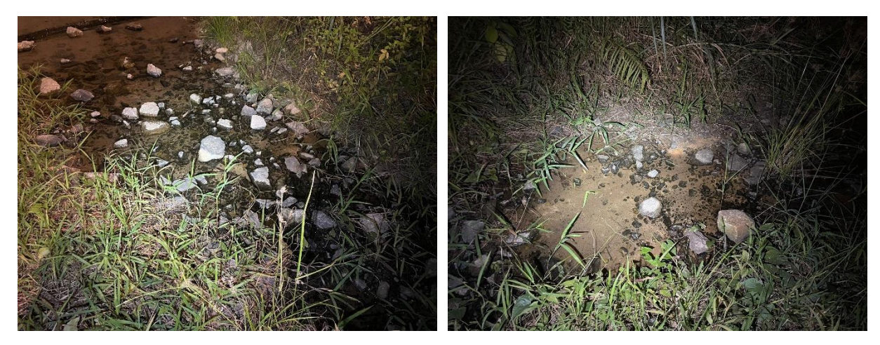
Photo 2.1: Section of the monitoring area with low gradient and low water flow