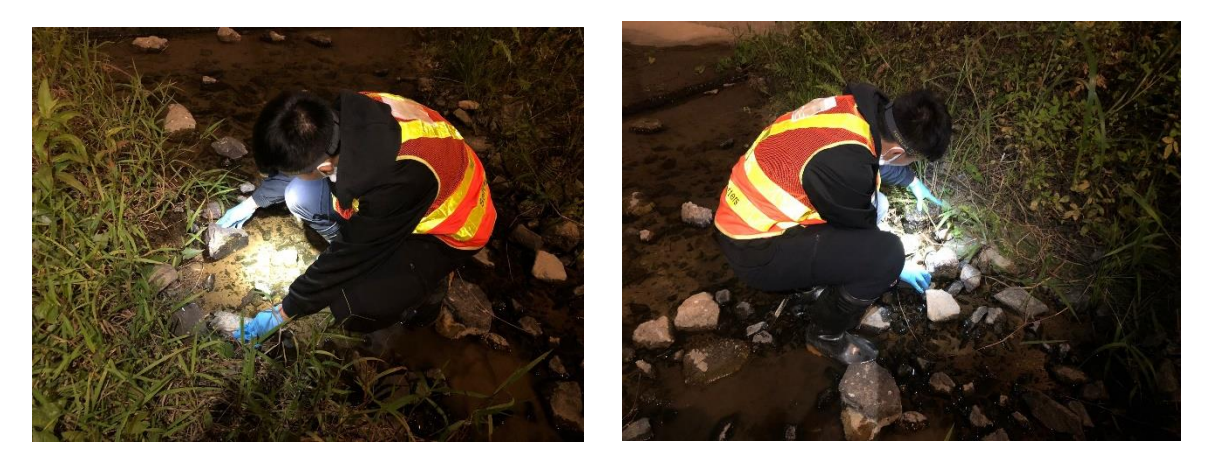
Photo 2.4: Surveyor searching for S. zanklon on potential hiding space (under vegetation and rocks) along the watercourse

Direct observation (see Photo 2.4 ) to search for S. zanklon in their potential hiding spaces was also conducted.