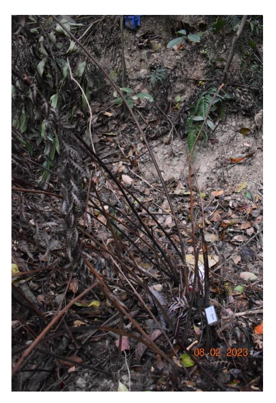
Photo B.2.4.: Stem condition of the transplanted individual CB-01.