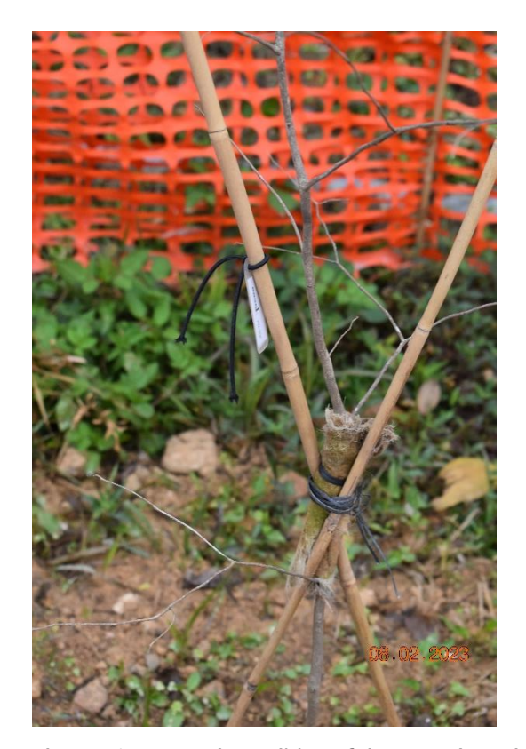
Photo B.1.4.: Branch condition of the transplanted individual AS-02.