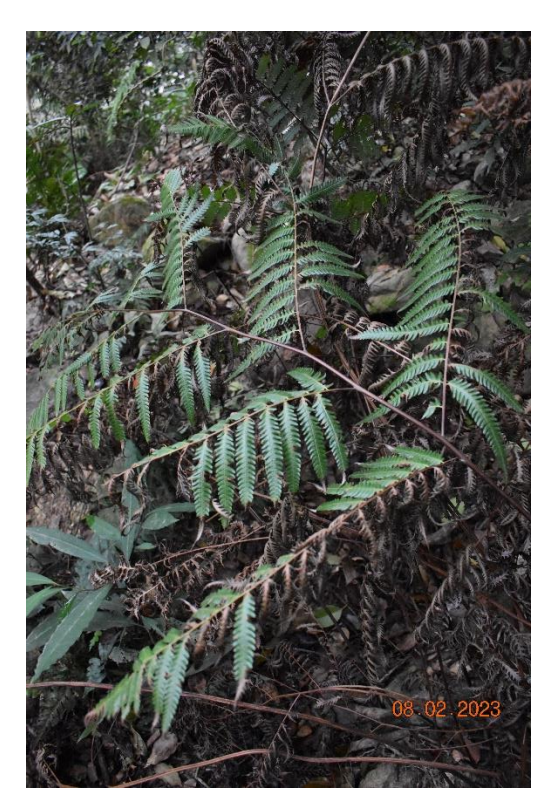
Photo B.2.3.: Leaf condition of the transplanted individual CB-01.