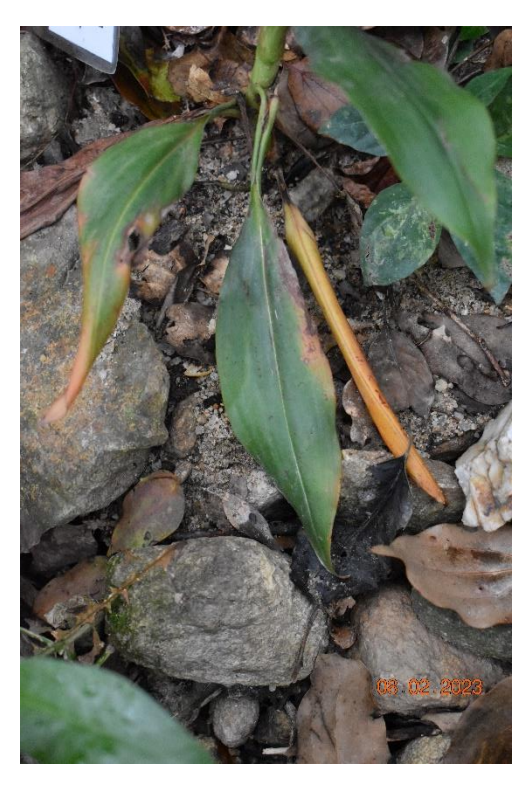
Photo B.3.26: Individual GP-19. Chlorotic and partially wilted leaves.