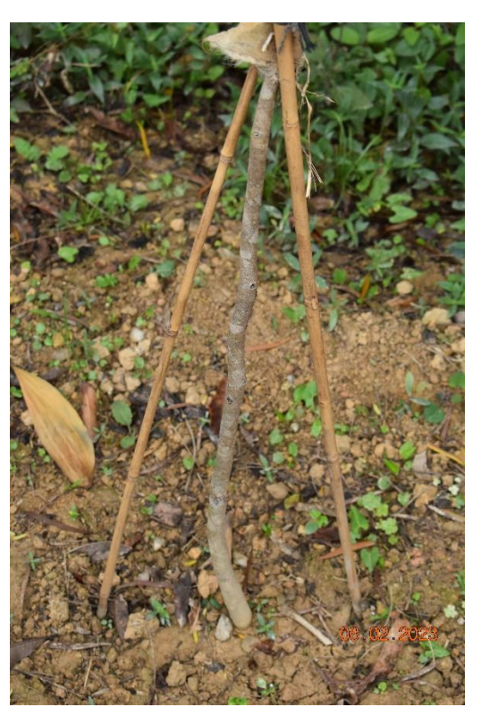
Photo B.1.2. : Stem condition of the transplanted individual AS-03.