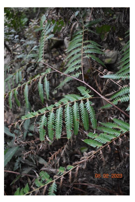
Photo B.2.2.: Leaf condition of the transplanted individual CB-01.