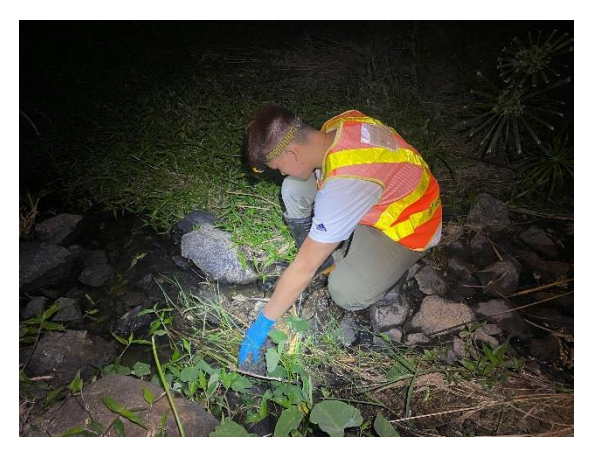
Photo 2.4: Surveyor searching for S. zanklon on potential hiding space (under vegetation and rocks) along the watercourse