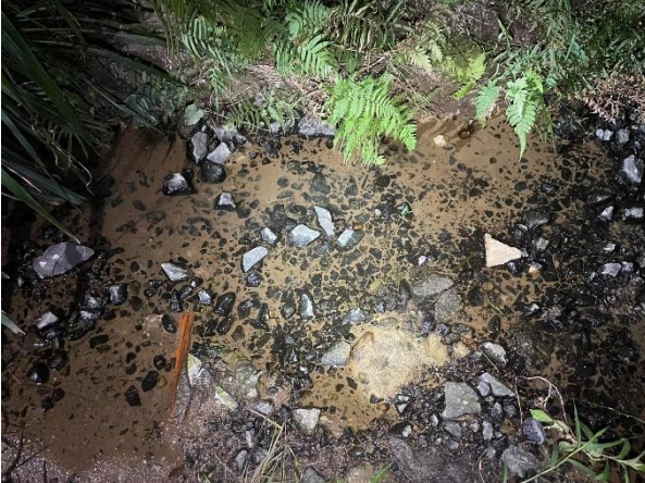
Photo 2.1: Section of the monitoring area with low gradient and low water flow