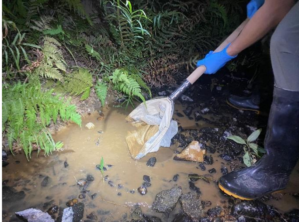
Photo 2.3: Surveyor kick-netting the substrate and checking the net's contents

2.4.3.2 Similar to hand netting, the net content was emptied on to a large sorting tray. All caught S. zanklon , if any, were carefully moved to a plastic container for post-translocation marking.