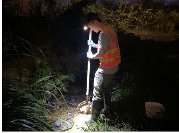
Photo 2.3: Surveyor kick-netting the substrate and checking the net's contents

2.4.3.2 Similar to hand netting, the net content was emptied on to a large sorting tray. All caught S. zanklon , if any, were carefully moved to a plastic container for post-translocation marking.