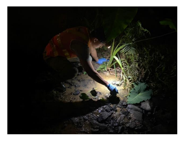
Photo 2.4: Surveyor searching for S. zanklon on potential hiding space (under vegetation and rocks) along the watercourse