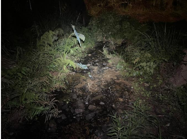
Photo 2.1: Section of the monitoring area with low gradient and low water flow