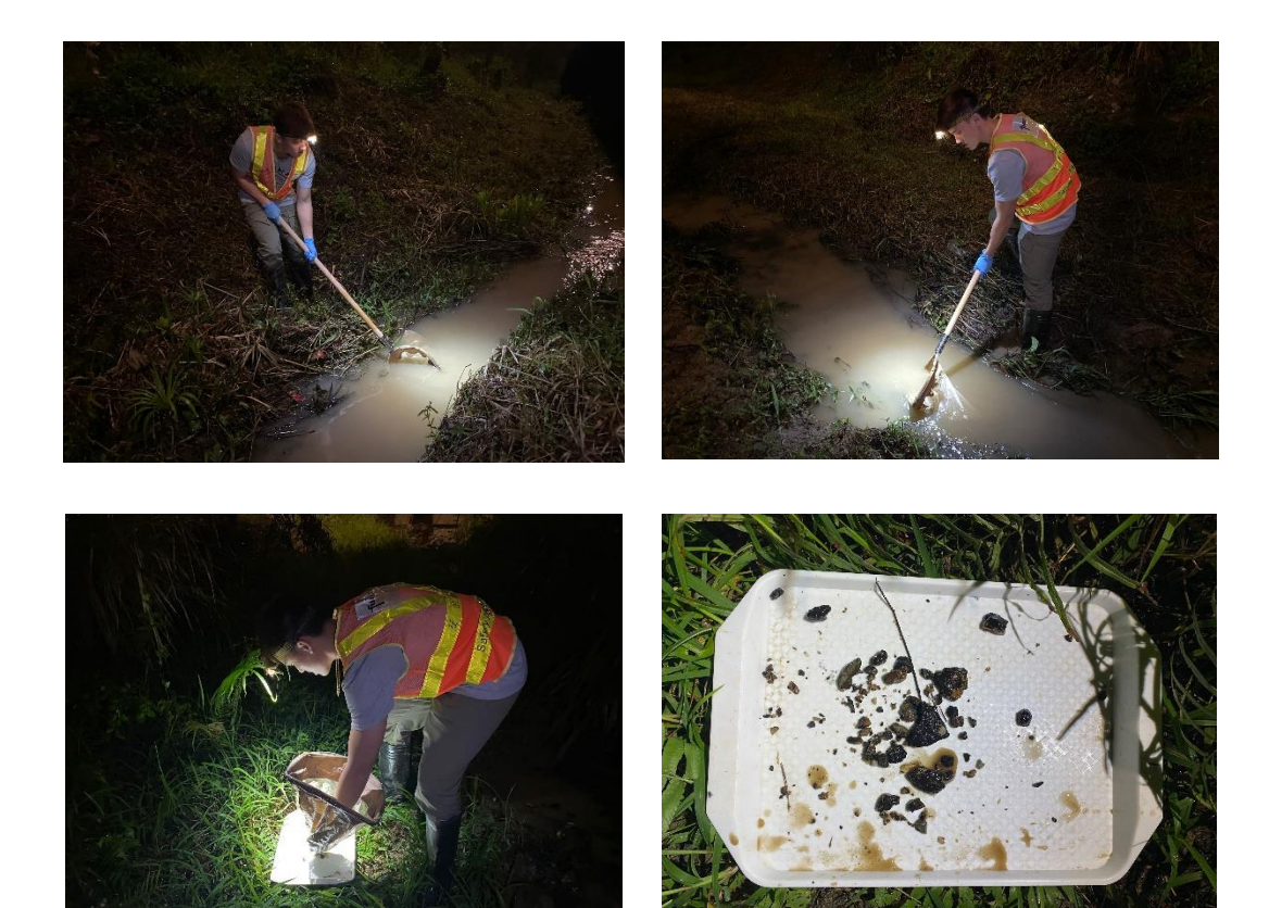
Photo 2.2: Hand netting at a potential habitat (vegetation) along the watercourse

2.4.2.1 Hand netting (see Photo 2.2 ) was used to search the potential habitats along the watercourse. The sweeping motion of the hand netting scraped the layer of the stream bottom substrate into the net, e.g., soil and leaf litter where possible, as S. zanklon is likely to be among these substrates. After taking the hand net out of the water, it was allowed to drain, and the net content was emptied on to a large sorting tray. All caught S. zanklon , if any, would be carefully moved to a plastic container for marking.