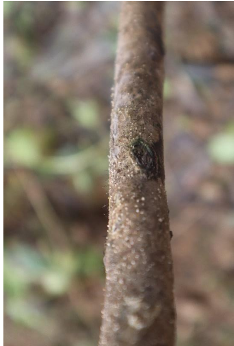
Photo B.1.2 : Stem condition of the transplanted individual AS-03.